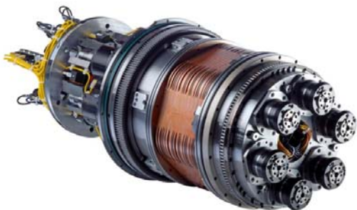
Figure 3: Spindle drum of the INDEX MS16 Plus with 6 fluid-cooled motorized spindles with synchronous technology