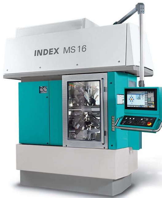
Figure 1: The INDEX MS16 Plus